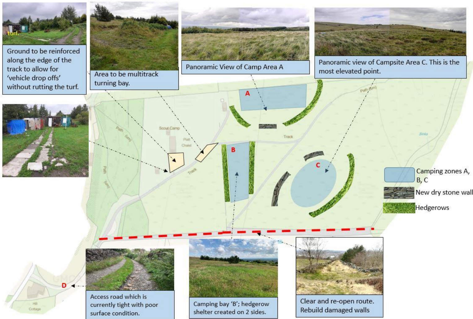
Figure 1. Phase One Physical Improvements